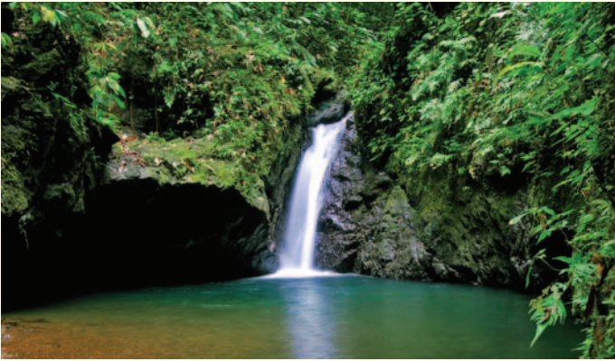
Waterfall in Corcovado National Park.

ecosystems, including mangrove, palm grove, montane forest, lagoon, and primary lowland rain forest. After naturalist guides lead you on a walk through the interior, enjoy lunch on board Sea Cloud II . In the afternoon, tender ashore to one of Drake Bay's pristine beaches for a swim.