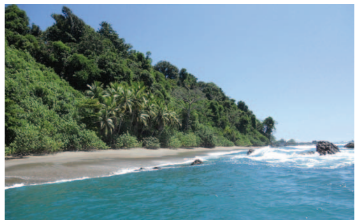
Isla de Cano.

Wednesday, February 1 This morning explore the incredible Corcovado National Park. Mostly undisturbed because of its isolated location, the park is home to scarlet macaws, quetzals, red-eyed tree frogs, and tapirs. Corcovado comprises 13 major