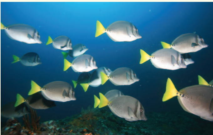
Marine life, Coiba National Park.

Saturday, February 4 Arrive today in Balboa, the port for Panama City. On an architectural tour of "Casco Viejo," the first Spanish settlement on the Pacific Ocean, see the Plaza de la Catedral, Palacio de las Garzas, and Las Bóvedas. Then visit the Frank Gehry-designed Bridge of Life Museum, which showcases the biodiversity of the Isthmus of Panama. Continue to the Miraflores Locks Visitor's Center, for an overview of the Panama