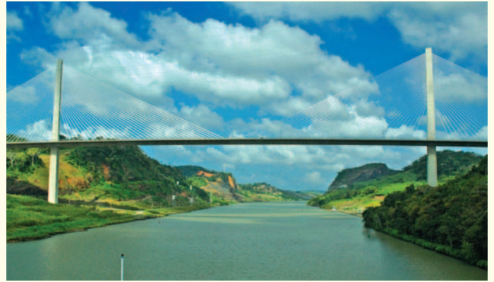
Centennial Bridge and the Culebra Cut, Panama Canal.

Canal's history and operations, and if the timing is right, an up-close look at a ship rising through the two-stage lock. Sea Cloud II remains in port overnight.