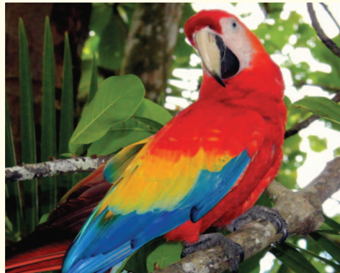
From the top: Sea turtle at Isla de Cano, a baby two-toed sloth, red-eyed tree frog, and a scarlet macaw in Corcovado National Park.