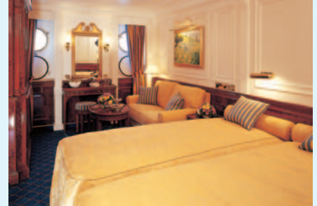
Owner's Suite (top) and a Deluxe Cabin on Main Deck (above).