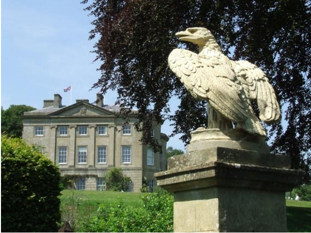
American Museum in Britain