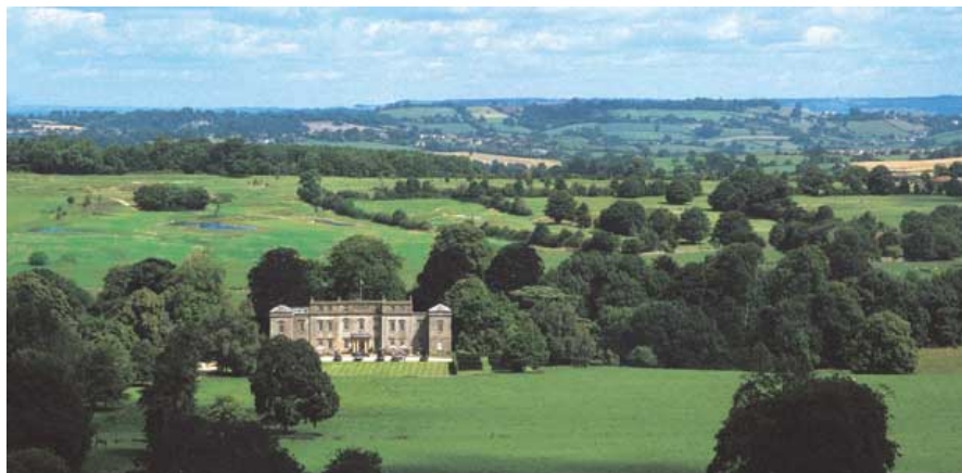
Ston Easton Park

Evening: Dinner in the Sorrel Restaurant at Ston Easton.